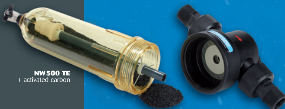
NW 500 TE + activated carbon

The activated carbon CINTROPUR is sold separately and is highly suitable for the improvement of taste and the removal of odour, chlorine, ozone, micropollutants such as pesticides and other dissolved organic substances.